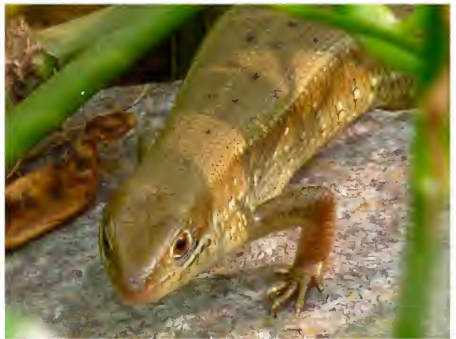
Fig. 2J. Spotted Supple Skink Lygosoma punctata .